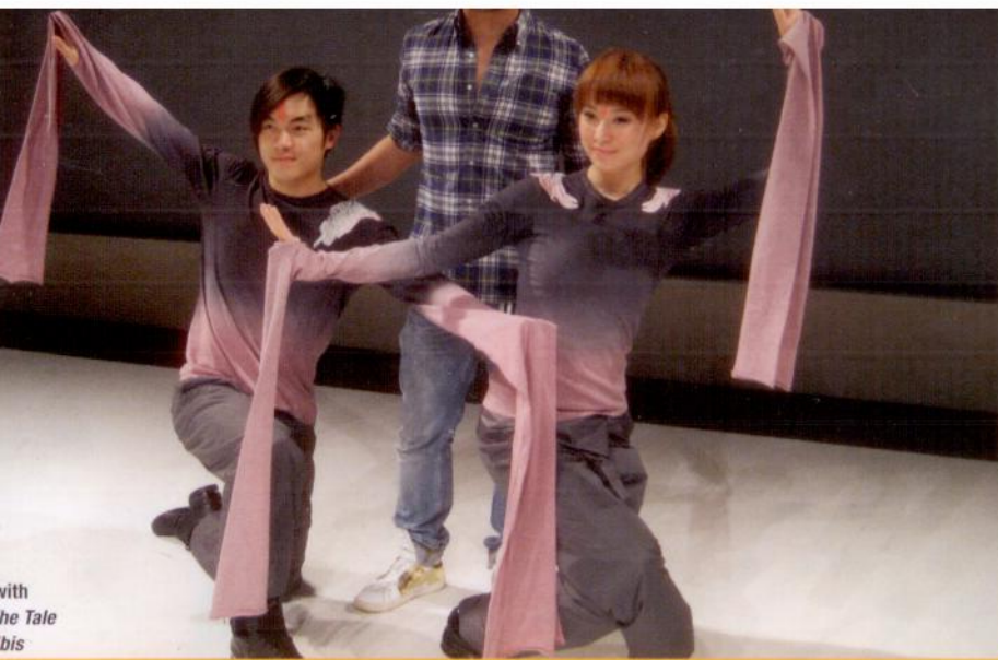
with the Tale of the Crested Ibis